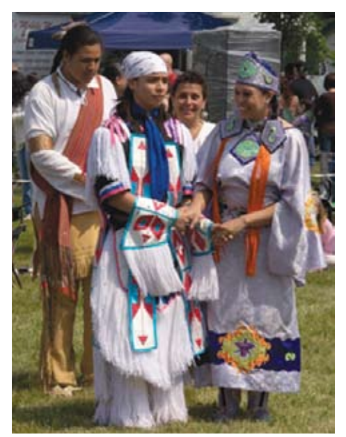
Pairs dance the Rabbit Dance

Tribal members enjoy social dances at the annual Massachusetts Center for Native American Awareness Spring Planting Moon Powwow on Saturday, May 23rd. The event was held at the Marshfield fairgrounds.